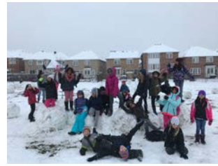
Winter Wonderland Fun!