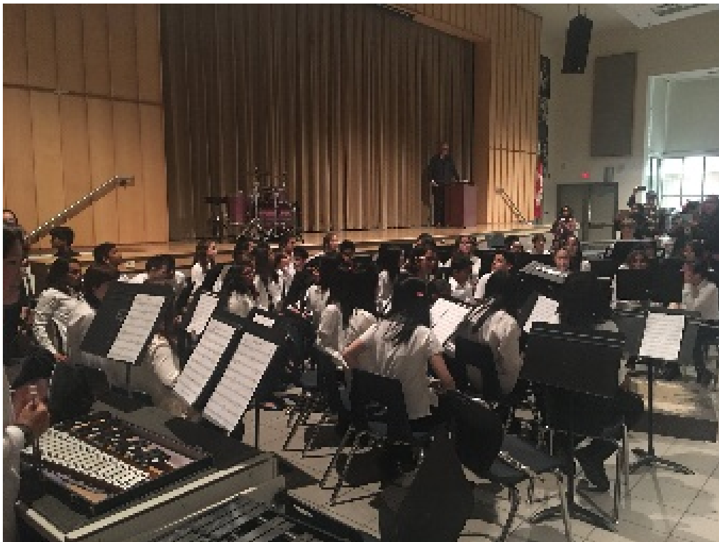
Intermediate Band at the Scholarship concert

Next week our school will be having a guest speaker. They will be here to talk to us about mental health and well being. We encourage you to ask your child about this presentation as it covers many important topics.